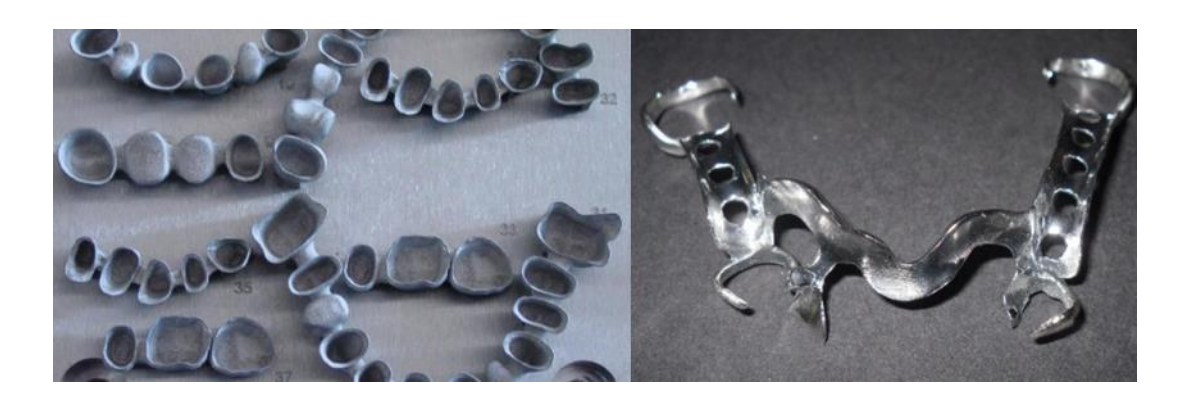
Figure 1. Metal objects obtained by 3D printing

Newer devices allow 3D printing of several types of materials, including metals and non-metals. So Steiner ProX™ 100 Dental system allows direct sintering of metal in order to create high quality metal dentures. This system enables 3D metal printing with obtaining chemically pure, very compact and highly precise parts (EN ISO 2768) with a tolerance of 20 microns in all three axes. It uses more than 15 materials including steel, stainless steel, super alloys, non-ferrous and precious metals as well as alumina (Figure 1.) (3).